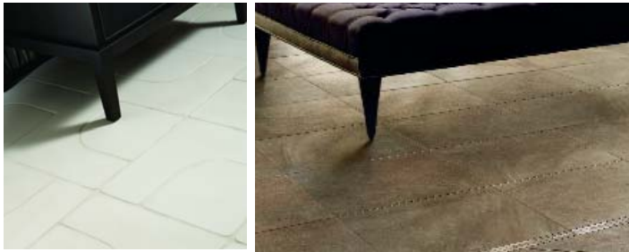
ABOVE LEFT: White matte concrete tile in an argyle pattern brings a soft contemporary touch to any room. Photo of Angela Adams concrete floor tiles for Ann Sacks ( www.annsacks.com )