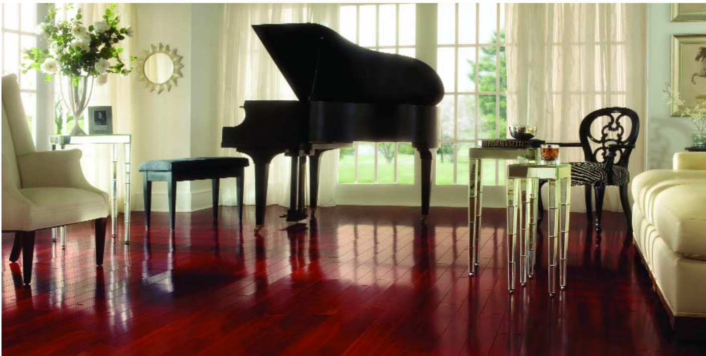
ABOVE: Make a statement of elegance with beautiful hardwood, here in planks of Brazilian Ruby Ironwood from Armstrong's Valenza Collection. Find Armstrong hardwood flooring at CC Carpet, The Home Depot, Lowe's and S&H Distributing.

HARD-SURFACE MATERIALS MAKE TIMELESS FLOORING OPTIONS