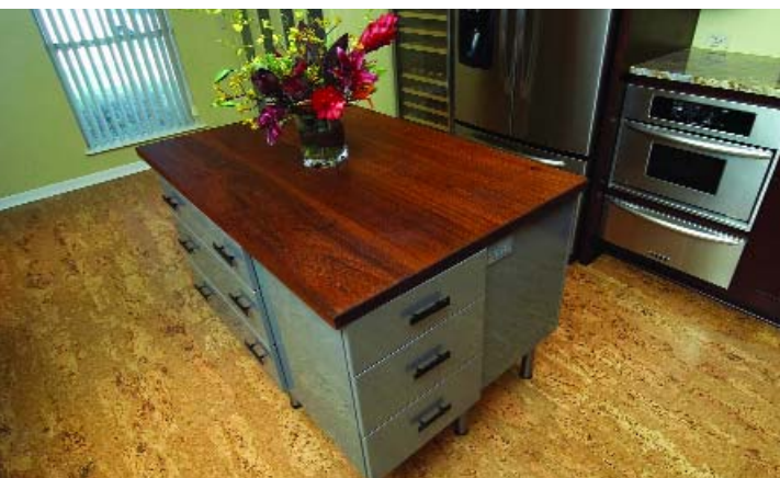
ABOVE: Cork is a green flooring option that looks great in traditional or contemporary kitchens.