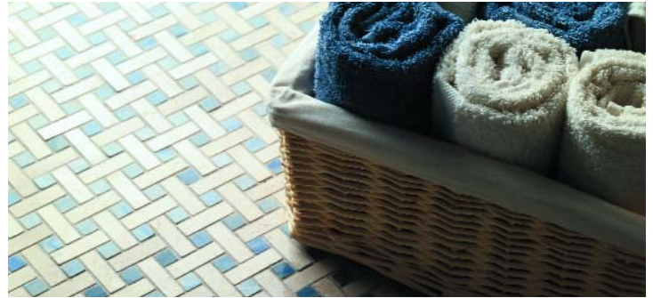
ABOVE: From Artistic Tile's "Field Mosaics" collection, a classic basketweave tile in "Azul Macauba Canestro." Shop for Artistic Tile products at Antique Floors.