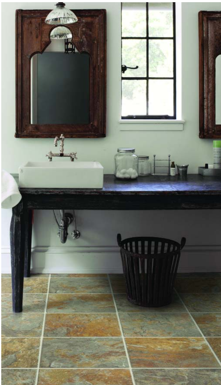
ABOVE RIGHT: Impressive century-smoothed limestone from the “Pierre de Cluny” collection by Marazzi, shown here in “Moka.”