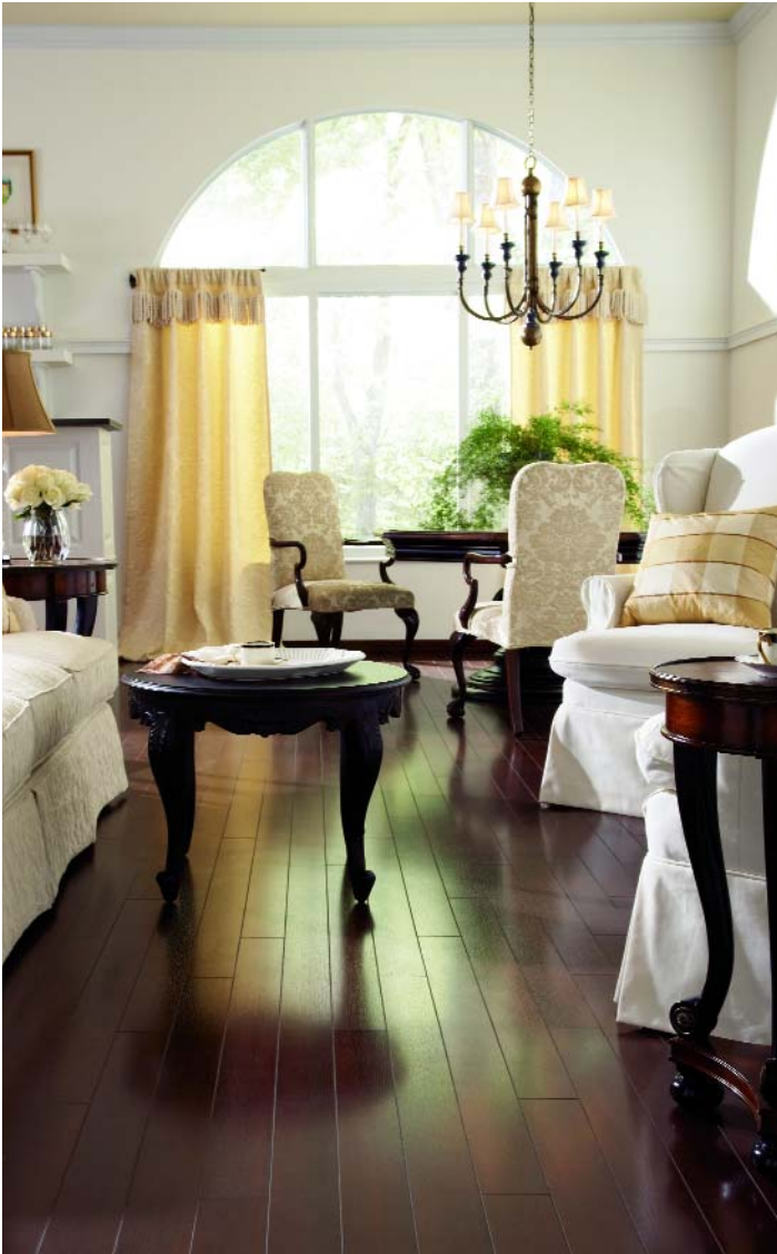
ABOVE: Have the best of both worlds: the classic look of wood and wear resistance with high-pressure laminate flooring by Wilsonart Flooring. Carpet Outlets of Texas is a Wilsonart Flagship Retailer.